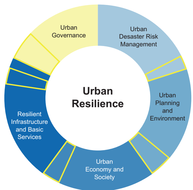
Figure 3: One concept of urban resilience and its fields (adapted from UN-Habitat). Within these fields, the scope of both the Guidelines and Action Areas is schematically outlined in yellow. The Action Areas in these Guidelines partly address this outlined scope.