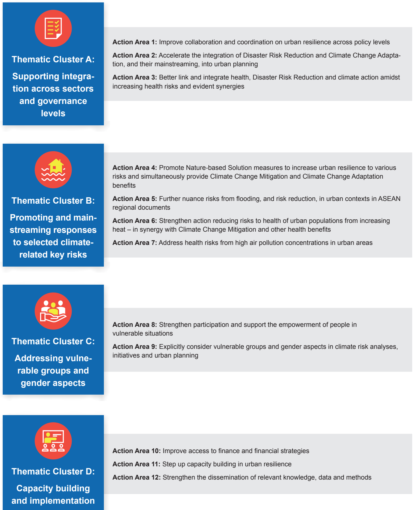
Figure 1: Thematic clusters and overview of the Action Areas.