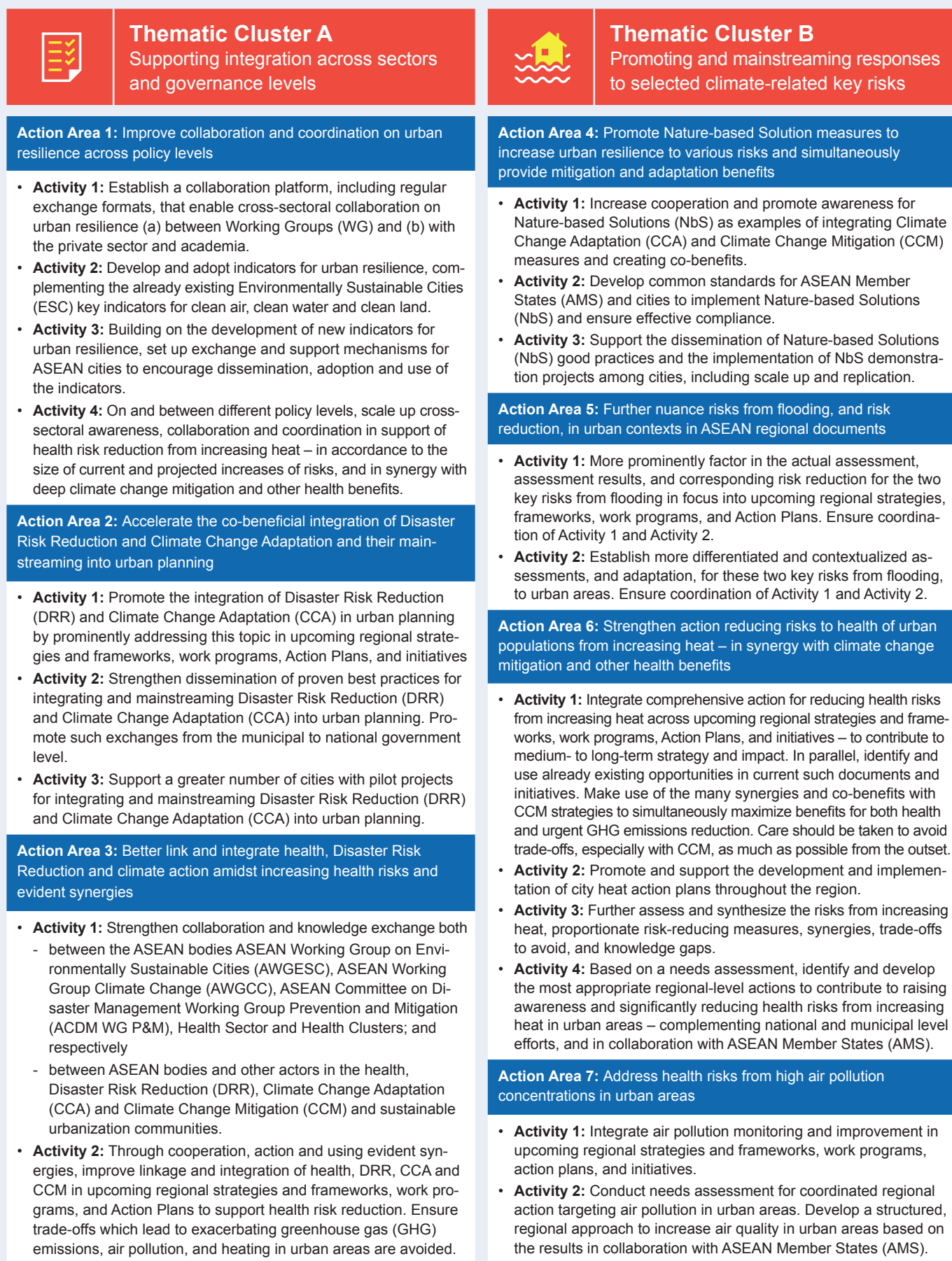
Table 1: Overview Clusters, Action Areas and Activities (some Activity titles are shortened).